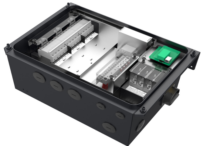
50/60kW Rapid Shutdown Wire-box