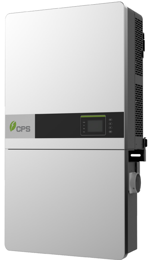
CPS SCA50KTL-DO/US-480 CPS SCA60KTL-DO/US-480