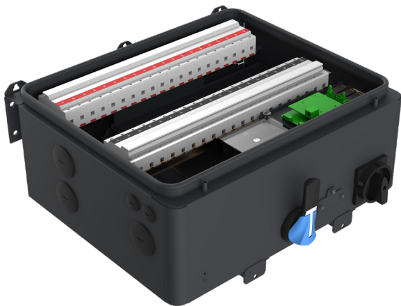
100/125KTL Standard Wire-box