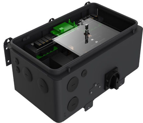
100/125KTL Centralized Wire-box